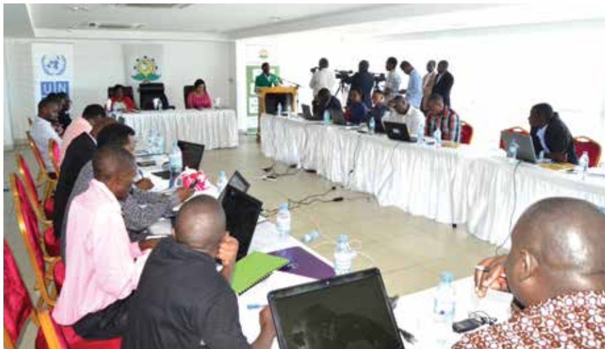
A cross section of Community Radios Representatives

achieve content, financial, social and institutional sustainability. She added that in order for the above mentioned radios to achieve their goals there must be a linkage with different stakeholders such as district councils, NGOs, Private Companies like (Airtel, Voda, Tigo), media houses etc this partnership will help to accrue contents as well as some can support radio operations.