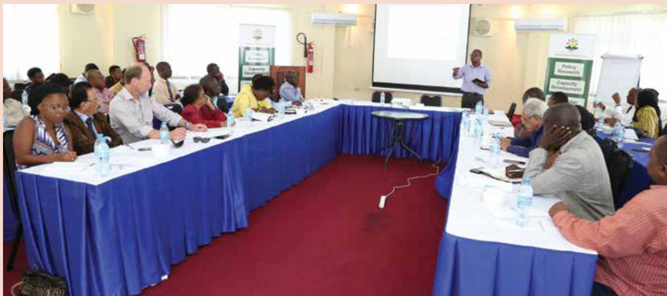
A cross section of participants of the Public Seminar

On Friday 13 th January 2017 the Economic and Social Research Foundation (ESRF) organized a Public Seminar on The Impact of Mining on Spatial Inequality in Africa which was held at the ESRF Conference Hall.