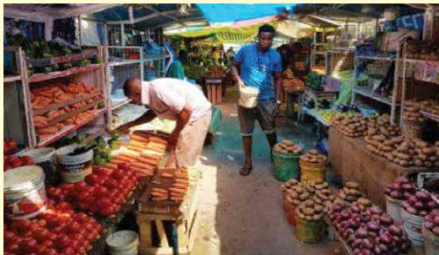
Horticultural products local market in Dar es Salaam.

The data from the smallholder farmers' survey was meant to inform the SSTP midterm evaluation in terms of: improved capacity of public and private sector groups to deliver quality seeds and other technologies to smallholder farmers; increased use of quality seeds and other technologies by smallholder farmers; and improved regional and country level policy and regulatory mechanisms for the