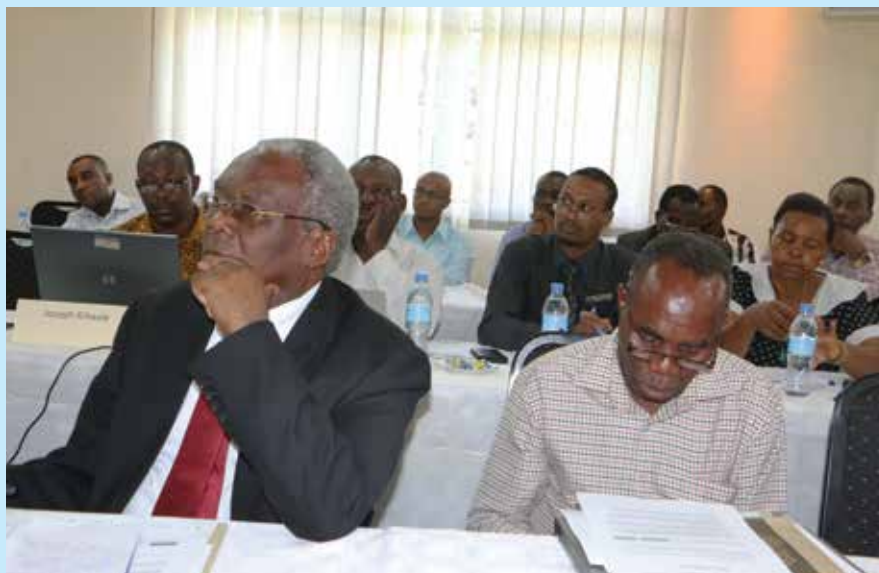
A cross section of participants.

“We thus seek to call upon the government and its partners to call for policy reviews to reflect the new emerging challenges related to opportunities and drawbacks presented by these linkages”, he concluded.