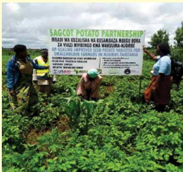
Scaling Seeds and Technologies Adoption Partnership (SSTP) field team at the SAGCOT Centre Ltd managed Irish Potatoes demonstration farm in Njombe Region.

The Mendez England and Associates (ME&A) a US based consulting firm subcontracted the Economic and Social