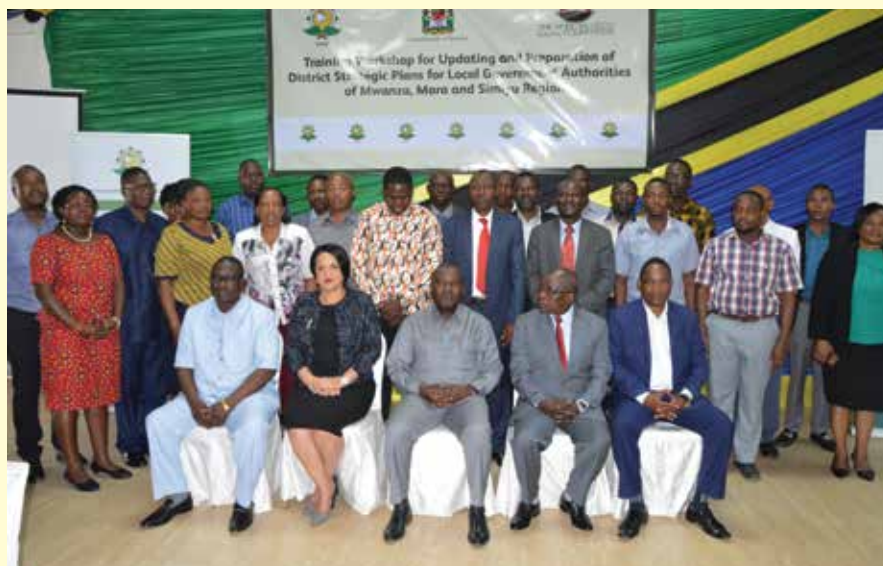
Participants in a group photo.