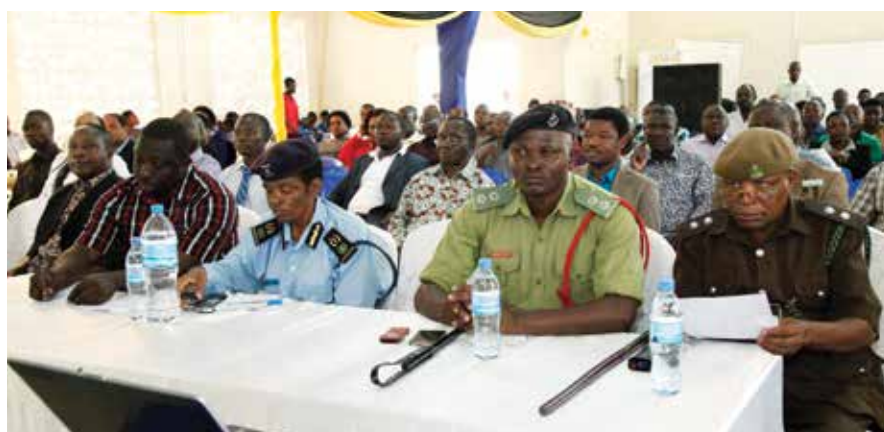
A cross section of participants who attended the inauguration ceremony.

The colorful event was held at the Economic and Social Research Foundation Conference Hall attracting participants from the government and its agencies, academia, development partners, private sector, civil society and the media.