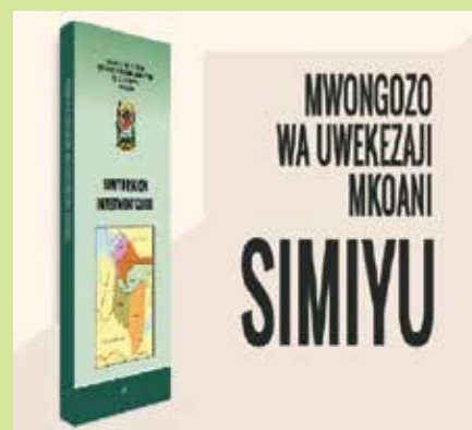
Inauguration of Simiyu Investment Guide

Moreover, in this first half of the year, the Department in collaboration with the Simiyu Region inaugurated the Simiyu Region Investment Guide which pinpoints twenty six investment opportunities; in agriculture, tourism, industries and livestock sectors, the guide is an aftermath of the study ESRF did in all districts of Simiyu.