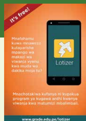
A Mobile App Flyer

In order to implement the project effectively, the project has set two goals that are; understand the socio-cultural elements and basic spatial notions that allow for informal occupations to follow rational, inclusive urban patterns as well as designing and developing a toolkit (Mobile App) composed of simple and cheap methodological cues and urbanization