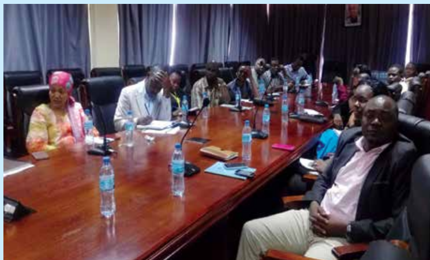
Directors and Heads of Departments at PO-RALG Headquarters Dodoma during a validation workshop for the practical norms study.

The main objective of this study is to identify and document industrialization