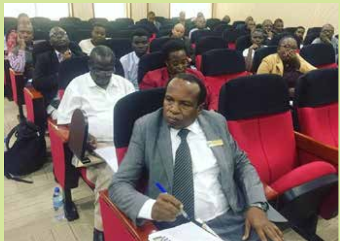
Participants following opening speech