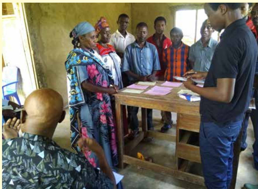
Focused Group Discussion with cloves farmers at Msalabani village in Morogoro Rural District Council, April 01, 2019