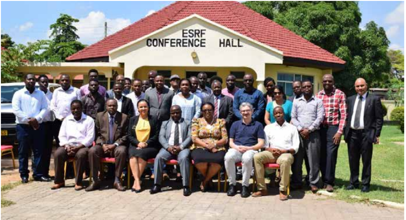
Participants in a group photo