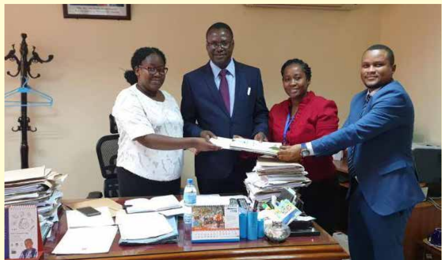
Some team members engaged with PORALG policy makers in Dodoma in March 2019

The AFRICAP project is expected to build capacity for research and knowledge exchange to underpin policy and practice, through co-designed activities and research training across UK and African institutions, and co-develop and demonstrate, nationally-owned Sustainable Development Goal (SDG)-compliant agri-food development pathways that can be productive, sustainable and climate-smart.