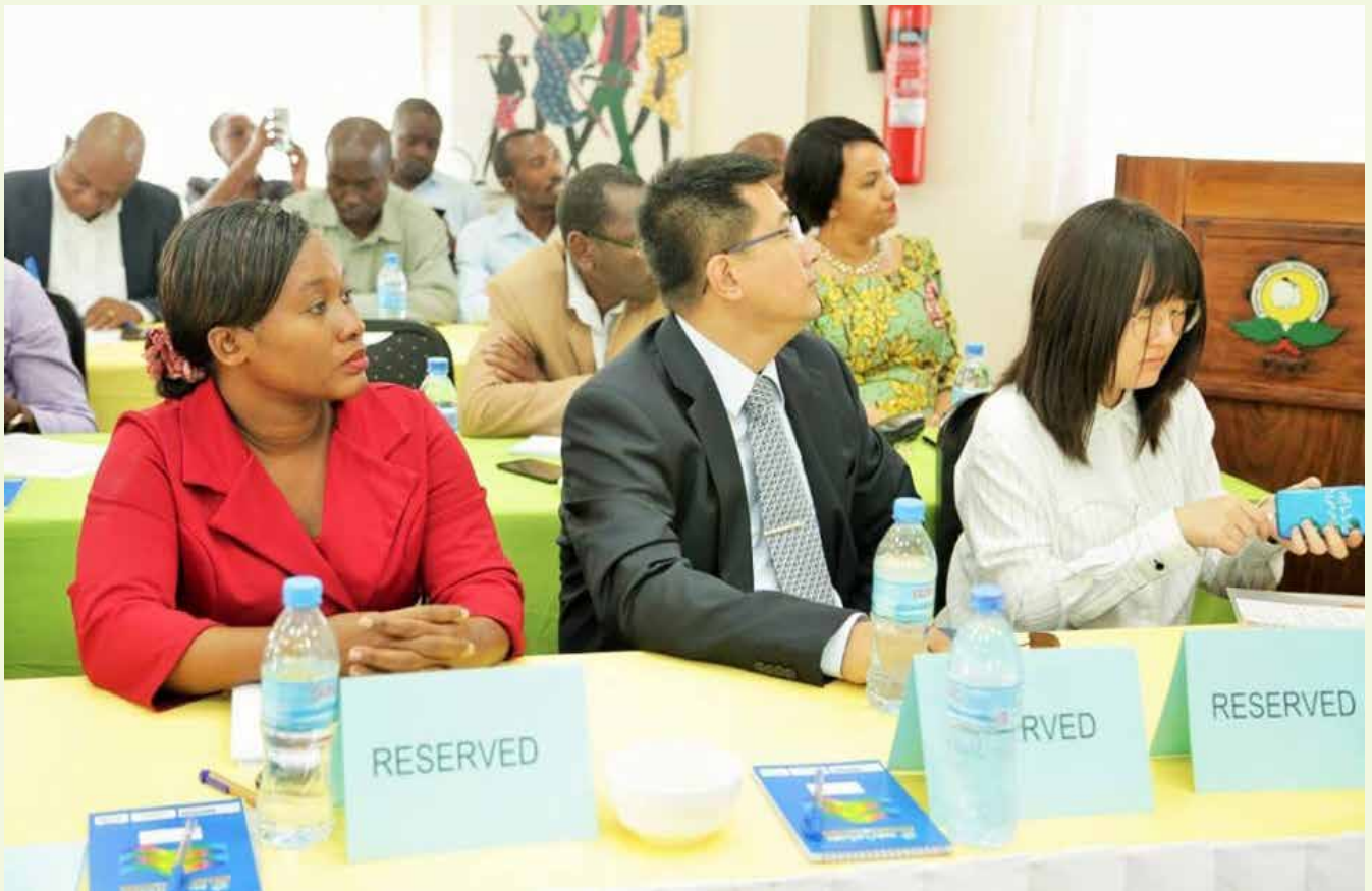
Participants following presentations

of the fastest growing economies in the world, has translated the higher per capita income by increasing the purchasing power of her people.