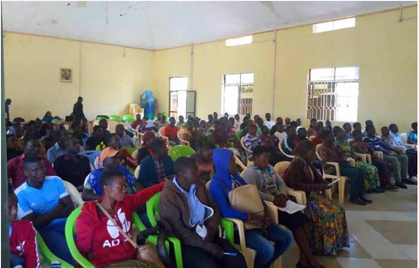
A cross section of youth who attended Youth Forum

Heifer commissioned ESRF to participate in a study that would search, map, identify and recommend national policies in Tanzania that would help to catalyze youth participation and inclusion in economic activities, particularly in agribusiness value chain.