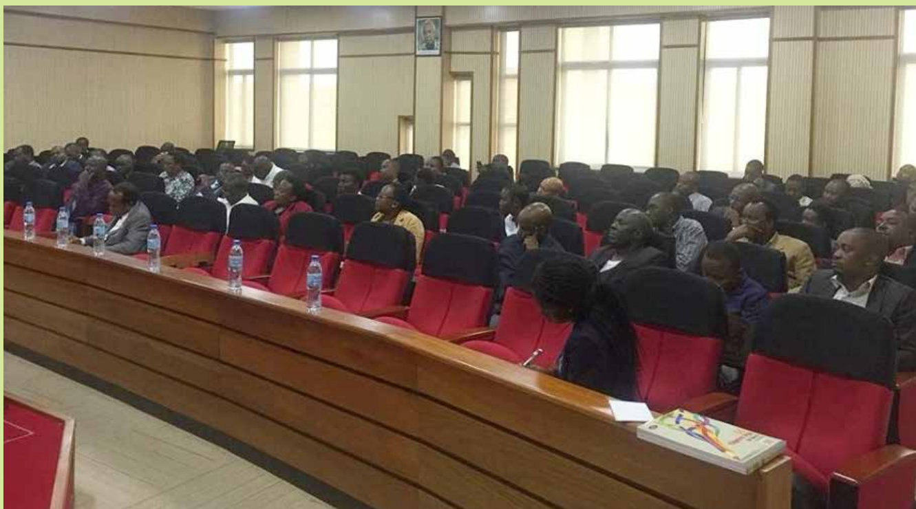
Cross section of participants