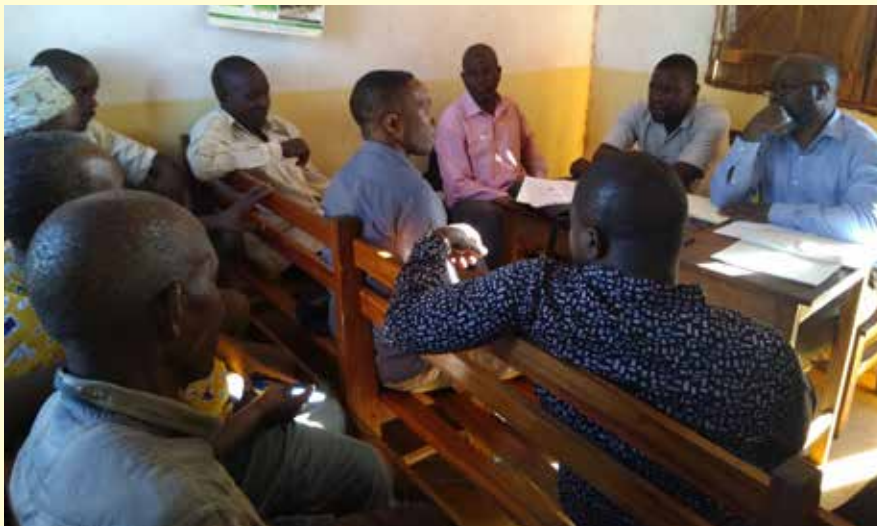
Research team members in a Focus Group Discussion with farmers for developing Agriculture Climate Resilience and Food Safety Net Strategy in Manyoni District Council, May 2019

especially National Food Reserve Agency (NFRA), Cereals and Other Produce Board (CPB), Warehouse Receipts Regulatory Board (WRRB) and Tanzania Mercantile Exchange (TMX); Food Insecurity Experience Scale (FIES) and standard methodology for computing Food Balance Sheet (FBS); Agriculture Climate Resilience and Food Safety Net Strategy (ARFS); Strategy Implementation Plan for the National Postharvest Management Strategy and lastly to incorporation of contract farming act into the Agriculture Act.