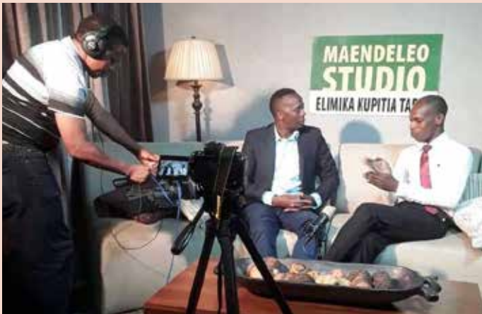
Preparation of contents (both audio and visual) for community radios and Knowledge TV at Maendeleo Studio.

The mainstay purpose of Knowledge Management and Innovation (KMI) Department is to support and facilitate policy research, action research, development management, various communications and localize different innovation to suit our. This work is done by three units; Communication and Information, Innovation and Knowledge Transfer and IT/Data Management.