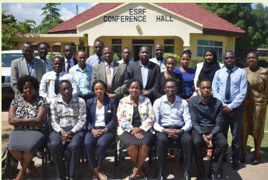
Participants to an inception workshop on "the Potential Effect Of Sugar-Sweetened Beverages Tax on Obesity Prevalence in Tanzania"

The main aim of the study is to estimate the potential impact of SSBs tax on obesity prevalence using mathematical simulation model, to provide evidence for policymaking and evidence-based actionable recommendations for implementation in Tanzania. Specifically three complementary main objectives underpin this general aim: To estimate the burden of non-communicable diseases