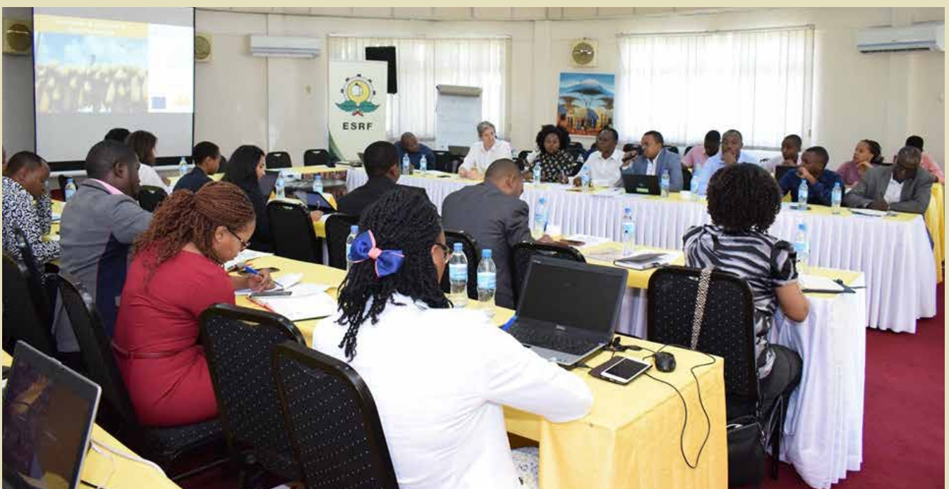
Participants in discussion

Between June 18th and 20th, 2019, the University of Edinburgh, the Centre for Competition, Regulation and Economic Development (CCRED) at the University of Johannesburg South Africa organized a three day workshop on innovation and inclusive industrialization in Agriculture and agro processing in Tanzania and South Africa. The workshop was organized in partnership with the Economic and Social Research Foundation (ESRF) in partnership with the Centre for African Studies (CAS) at the