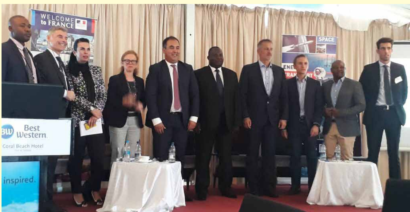
Some of participants to the French Energy Day in a group photo. The Economic and Social Research Foundation (ESRF) presented Studies on Oil and Gas Sub Sector which are undertaken by the Foundation.