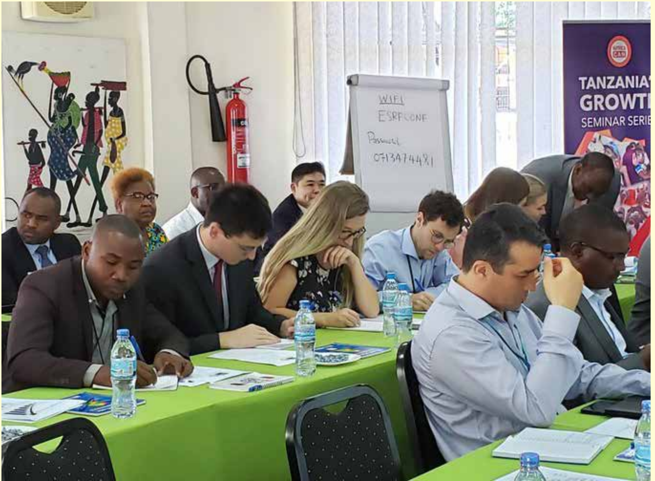
Cross section of participants who attended the Seminar organized by the World Bank Tanzania and ESRF discuss Tanzanian Economy