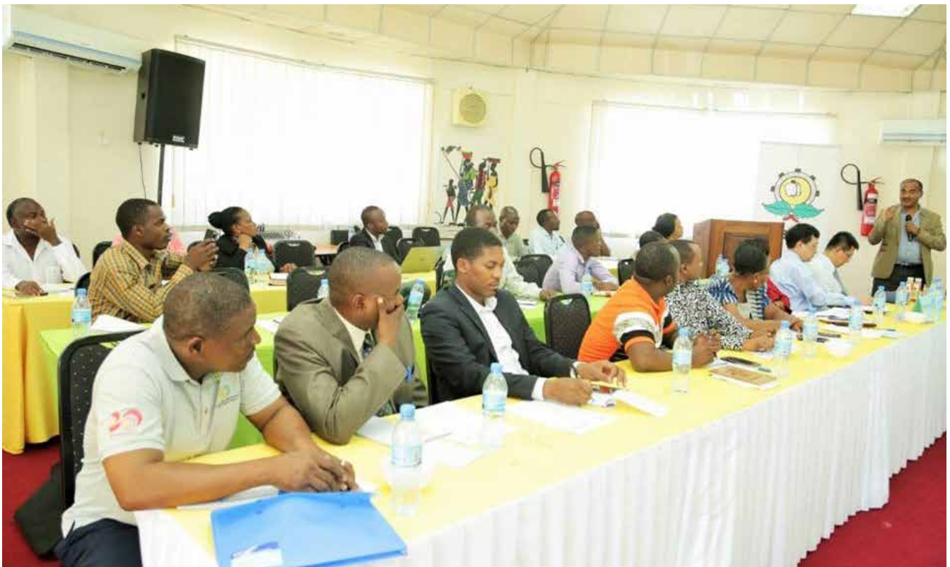
Participants keenly following the presentation

Chinese market is limited due to various reasons. The workshop attracted a broad range of participants from Government Ministries, Research and Higher learning Institutions, Private Sector and Non Government Organizations.