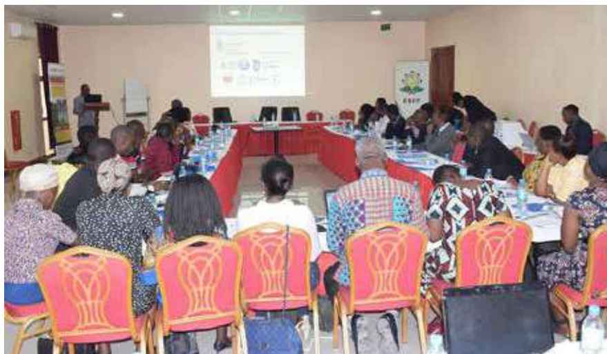
Participants following a presentation

In each country the TISA Project seeks to engage with government agencies, policies and programs to demonstrate how best to implement existing policy commitments or where there is a gap, to seek further reform.