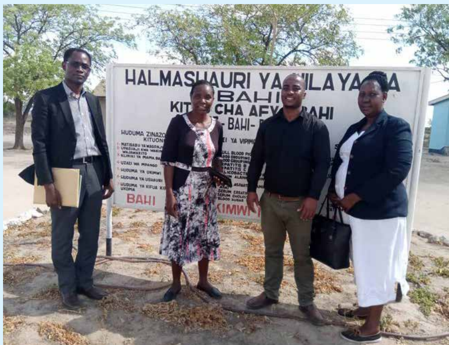
Researcher ready for taking data for Sugar Sweetened Beverages Tax on Obesity Prevalence

Strategic Research and Publications Department (SRPD) is the Foundation's core component and well-positioned to contribute to impactful evidence-informed research outputs. The department has systematically used evidence to assist policy actors to make informed decisions to improve social and economic policies that align with National Development Vision 2025, plans/programs/strategies, Regional Agenda such as Agenda 2063 and Global Agenda such as Agenda 2030.