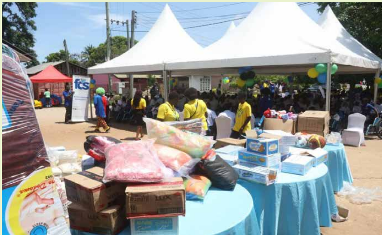
Some goods presented on GIVINGTUESDAY Events

mattresses, mosquito nets, bed sheets to mention the few.