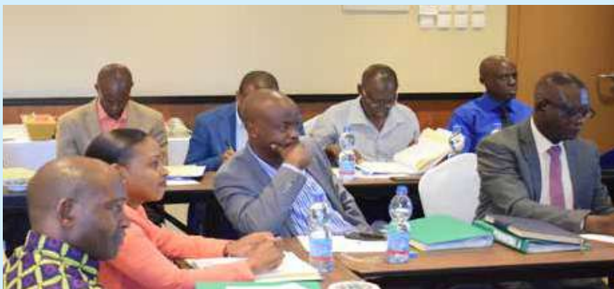
Participants following first session on day one of the Review workshop of inception reports: Development Financing program at Ramada resort in Dar es Salaam.

to improve the situation of children and adolescents in Tanzania cities. To make this achieve its goal, three workshops were staged at Morena Hotel in Dodoma on 11 th , September 2019, the second on 23 rd , October 2019 in Mbeya and the third on 11 th , December 2019 in Dar es Salaam.