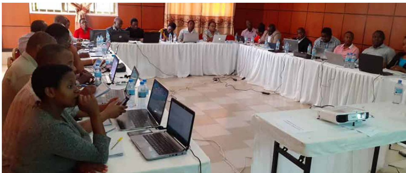
A cross section of Government Officials who participated in Impact Evaluation Training.