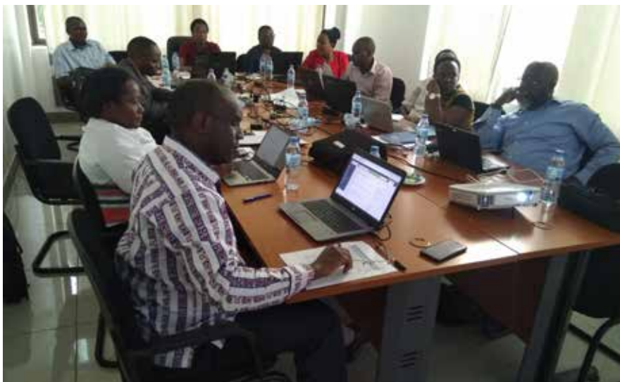
Research team and task force members jointly reviewing draft reports, Kingsway Hotel Morogoro.

“Transforming Smallholder Irrigation into Profitable and Self-Sustaining Systems in Southern Africa” (TISA) in Tanzania. The project is implemented in Mozambique, Tanzania and Zimbabwe and its justification comes from the reality that Sub Saharan African frequently faces food deficits mainly due to over dependence on rain-fed agriculture, limited use of modern farming inputs and implements, unimproved agricultural productivity and value addition as well as limited accessibility to regional and global crop markets. The Project is funded with support from the Australian Government via the Australian International Food Security Research Centre of the Australian Centre for International Agricultural Research with additional contributions from participating organizations including the Food, Agriculture and Natural Resources Policy Analysis Network (FANRPAN).