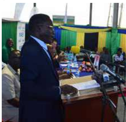
Hon. Mizengo Peter Kayanza Pinda - the Retired Prime Minister of the United Republic of Tanzania officiating Agribusiness Workshop at Nyakabindi Hall.

The workshop on Agribusiness was colored by ten presentations from the experts in agriculture, fishing, livestock keeping, banking, entrepreneurship, technologies (SIDO). In agriculture subject areas included; poultry, entrepreneurship, green house technology, Hydroponic fodder, Hydroponic vegetable,