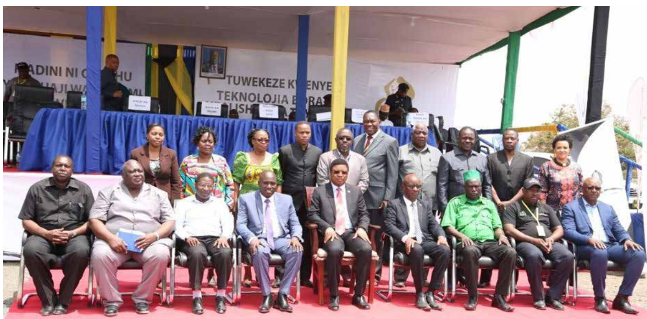
Hon. Kassim Majaliwa - The Prime Minister of the United Republic of Tanzania in a group photo with government officials and key stakeholders during the launching of Geita Region Investment Guide.