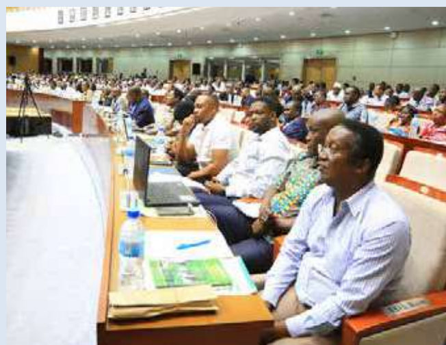
Cross section of participants