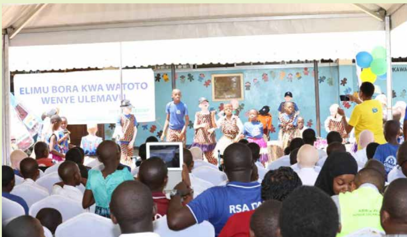
Children with disability dancing during the "GIVINTUESDAY" Event.