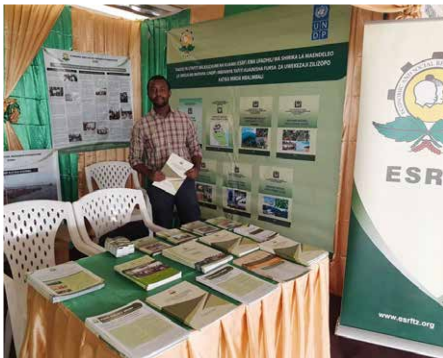
ESRF Exhibition Booth where products and services were showcased

in production of rice husk briquettes, in Bunda and Kondoa Districts, farmer groups in Nyatwali, Kibara and Kikore villages were assisted in smart farming whereby these farmer groups are now able to produce a variety of vegetables through modern farming.