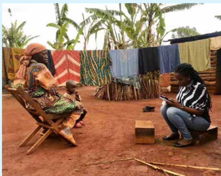
Researchers conducting Household interview.