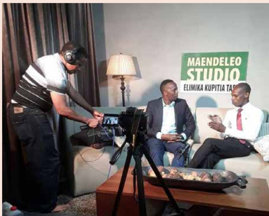
Production of programs at Studio Maendeleo

Our online and offline tools have been in a fore front to inform our broad range of stakeholders on different products and services the Foundation has been offering to them. Maendeleo studio persevered to translate various research outputs into simpler formats (Audio and visual) and disseminated them through established community radios and Foundation's online television. Developmental programs shared included those on gender issues, climate change, environment etc. Foundation's key issues including workshops, seminars, trainings, meetings were disseminated through mailing lists, e brief as well as websites. Exhibitions were used to reach wider audience, example the 2019, Nanenane Exhibition in Nyakabindi, Simiyu and Civil Society Exhibition in Dodoma, where stakeholders got opportunity