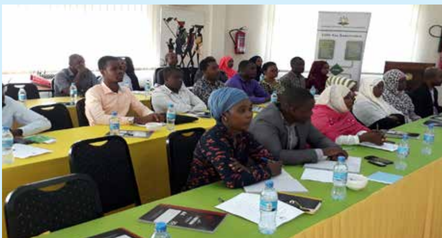
Participants following the first session on "Tanzania policy development process in a historical perspective" by Prof. Samwel Wangwe

The Department also organized a four days training workshop on Economic Management and Budget Analysis - 26th to 29th August, 2019 in Dar es Salaam. The most cited areas were on the evolution of Tanzania's development policy since independence in 1961, aiming at providing planners and economists in the public sector with knowledge on Tanzania's development process in a historical perspective as well as improving their capacity in planning and implementation of development policies and strategies. Topics covered included; Tanzania policy development process in a historical perspective" facilitated by Prof. Samuel Wangwe, Principal Research Associate, ESRF, "Instruments for economic management: Monetary & Fiscal policy" facilitated by Prof. Honest P. Ngowi, Principal, Mzumbe University, "Budget Analysis: Budget Preparation and