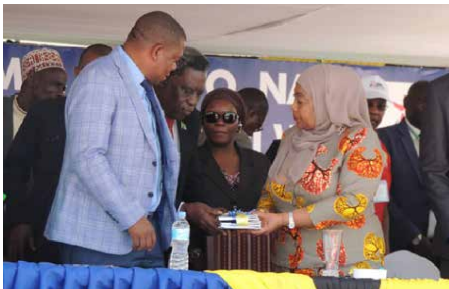
The Vice President of URT, Mama Samia Suluhu Hassan launched the National Postharvest Management Strategy in Simiyu region during Nane nane Exhibitions

The project undertakes detailed work in Malawi, South Africa, Tanzania, and Zambia. It strives to take learning beyond these four countries with the help of pan-African organizations.