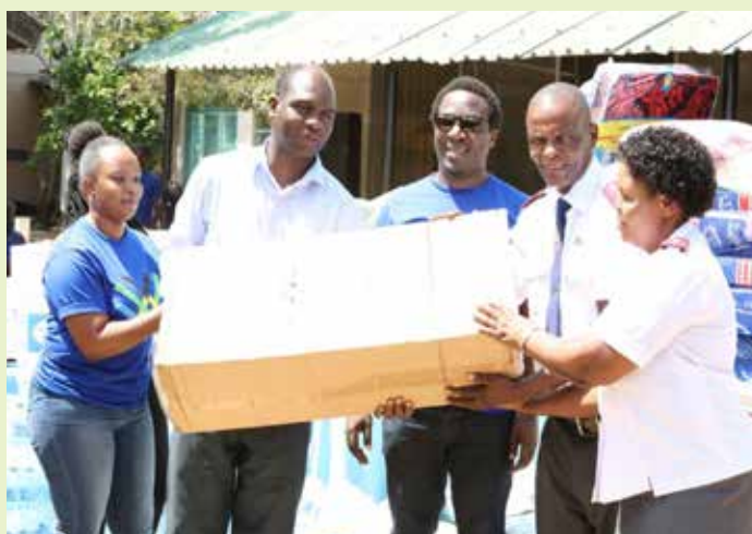
Different institution contributed various goods to support children with disabilities.