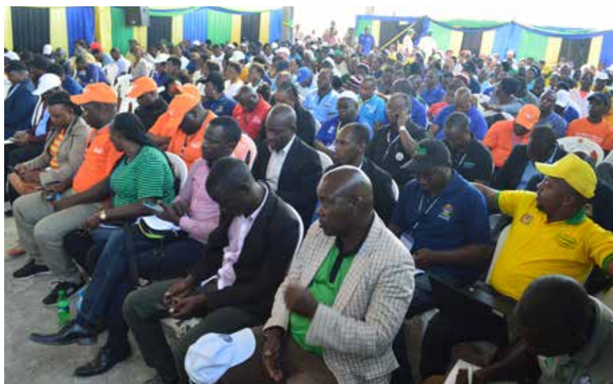
Cross section of participants

The workshop aimed at revealing opportunities which are embedded in