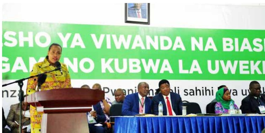
Hon. Angellah Kairuki - Minister of State in the Prime Minister's Office responsible for Investment delivering a Key Note Speech ahead of launching Pwani Region Investment Guide.

Preparation for the Investment Guides was done by the Economic and Social Research Foundation (ESRF) in partnership with the government of Tanzania under the financial support from the United Nations Development Programme (UNDP).