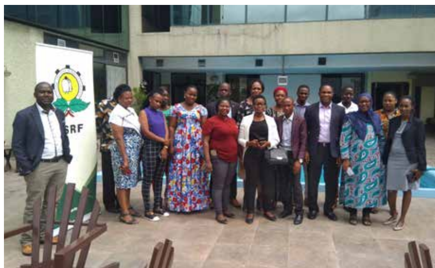
Group photo with media representatives who participated in a GCRF-AFRICAP media engagement training at Seashells Hotel in Dar es Salaam on November 28, 2019.

(2016–2020). The core activities undertaken by the department include conducting social-economic policy research, writing proposals and expression of interests, strengthening networks as well as contribution to the newsletters and discussion papers from commissioned works.