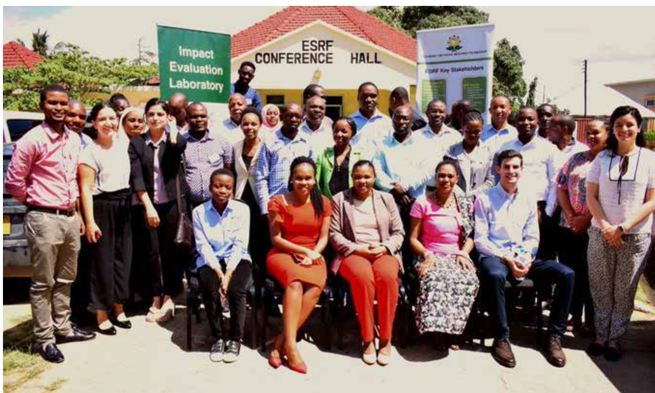
Participants of training workshop on Impact Evaluation: Urban Poverty and Public Transportation in a group photo.