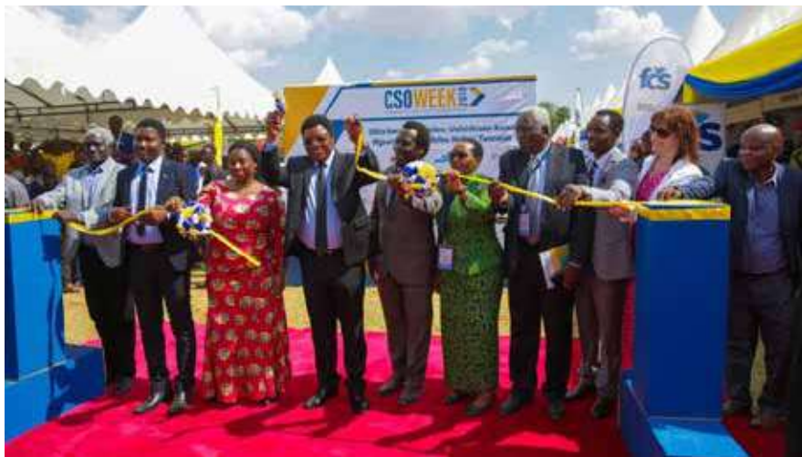
Hon. Kassim Majaliwa- Prime Minister United Republic of Tanzania cutting a ribbon to mark an official opening of Civil Society Organization Week

The vibrant Exhibition was officiated by Hon. Kassim Majaliwa - The Prime Minister of the United Republic of Tanzania, marking the beginning of the week long of Civil Society Organization. The four day exposition which carried a theme: “Progress through partnership: Collaboration as a drive for Development in Tanzania”, proposing Tanzania to achieve its development vision and achieve the level of growth envisage in the Sustainable