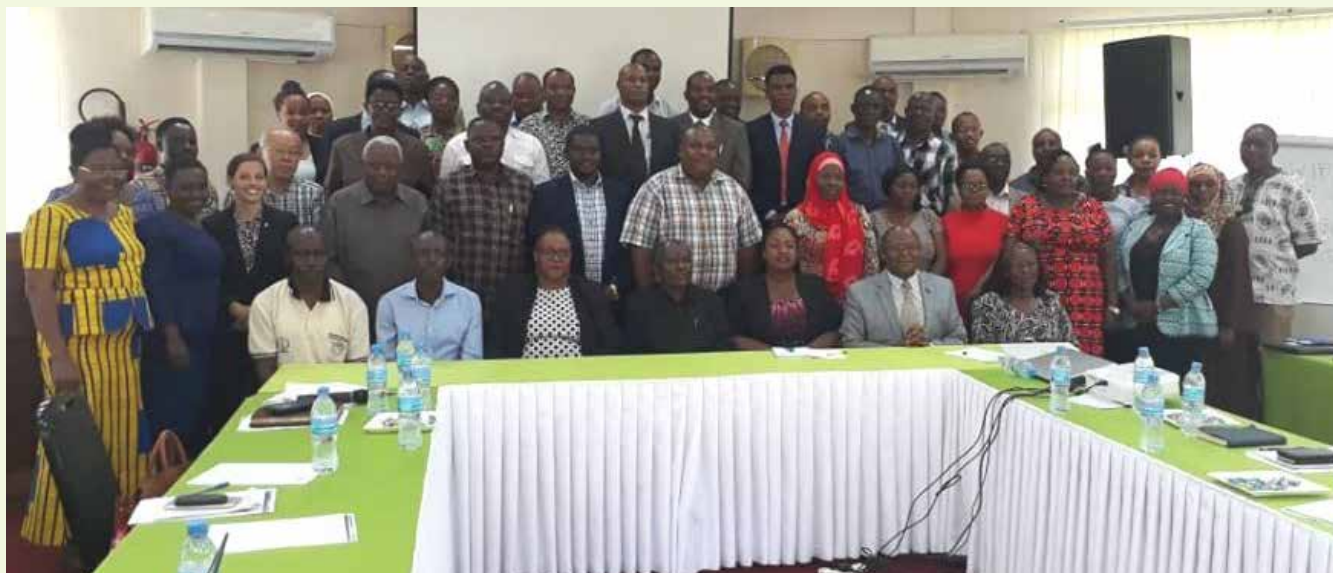
Participants in a Group Photo