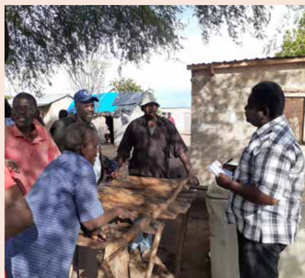
Consultants conducting Focus Group Discussion with fishermen at Malambo Village- Busega ahead of the execution of Nyamanyili Fish Cage Project.